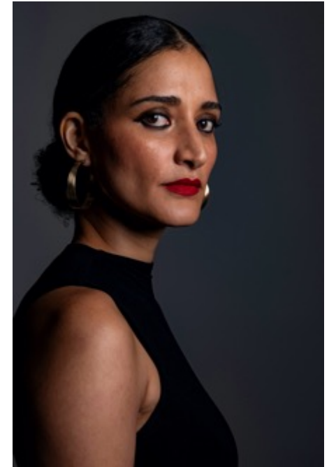
Hair : Brown Eyes : Brown Height : 1,68m Language : English, Portuguese & Afrikaans